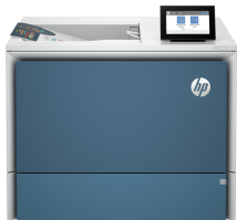
HP Color LaserJet Enterprise X55745dn Printer

This printer is intended to work only with cartridges that have a new or reused HP chip, and it uses dynamic security measures to block cartridges using a non-HP chip. Periodic firmware updates will maintain the effectiveness of these measures and block cartridges that previously worked. A reused HP chip enables the use of reused, remanufactured, and refilled cartridges. More at: http://www.hp.com/learn/ds